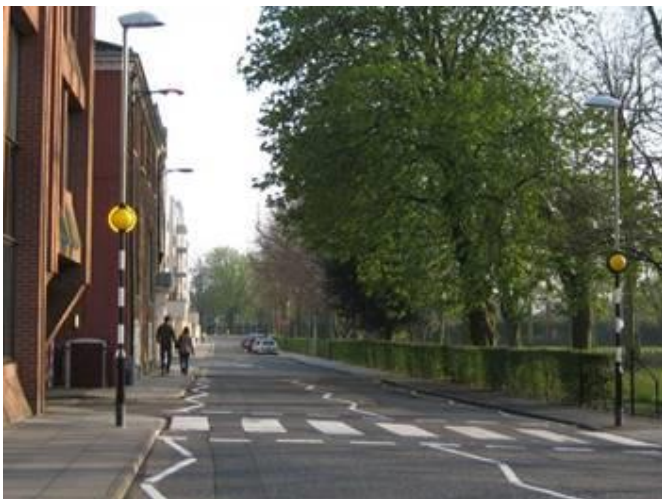
Example of 'zeebrites' crossing

You may remember earlier in the year that the parents' forum had a petition to present to Portsmouth City Council about reinstating a lollipop person at the zebra crossing outside the school due to the number of incidents that have taken place. We've had a reply back stating that "PCC does not have the resources to provide a school crossing patroller on a zebra crossing and doing so is also counter to the national guidelines for crossing patrols." However, what they have said is that they will pursue "an upgrade of the crossing beacons to 'zeebrites'. As detailed in the picture below - they are significantly brighter than conventional lights and will provide the best warning possible to drivers." Thank you to all who signed the petition. We hope that the upgraded lights will help alert drivers to watch their speed when approaching the crossing. If you have any other ideas about this, or if you would like to come along to our parents' forum meetings, contact me on dave.aarons@paulsgrove.org.uk . Our next meeting will be in January (date TBC). Thank you – Dave Aarons